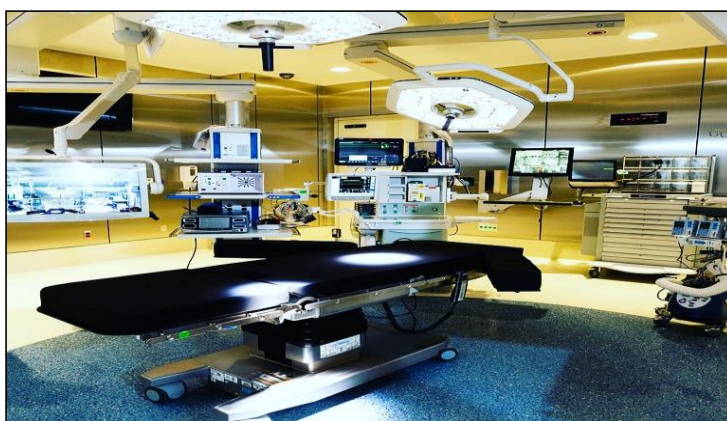
Modular Operation Theatre